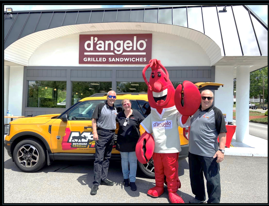
Remote Broadcast at D'Angelo's, Laconia NH